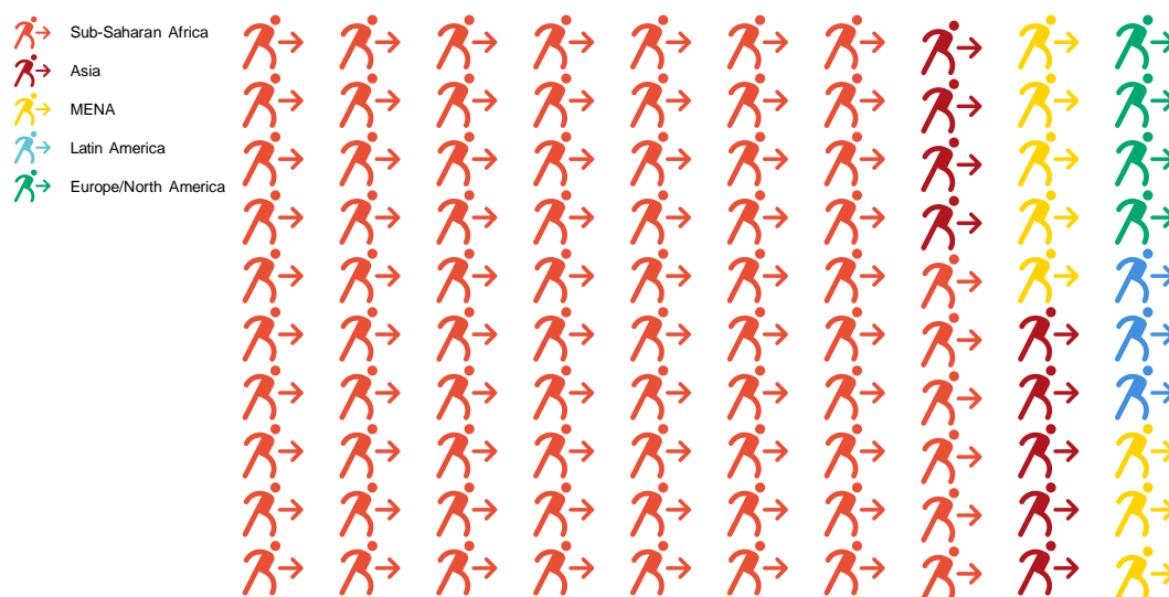
Figure 3: Illustration of geographical distribution of 100 people fleeing

This difference is because displacement tends to happen in low- and lower-middle-income countries and forecasts are on average higher in countries with a higher share of internally displaced. In the 14 countries where more than 75% of displaced people were internally displaced at the end of 2021, the average forecasted growth in displacement in 2022 is 13%. In countries where less than 75% of displaced people were internally displaced, the average forecasted growth is only 6%.